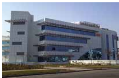
MOBINIL - Smart Village