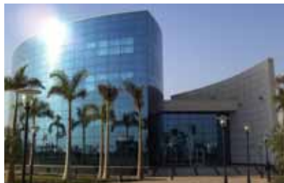
Service Complex - Smart Village