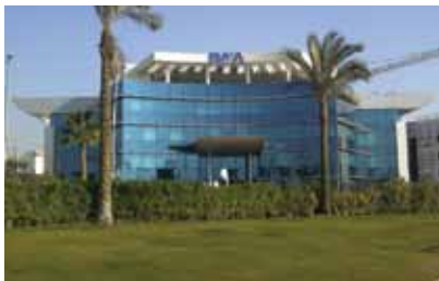
RAYA Building - Smart Village