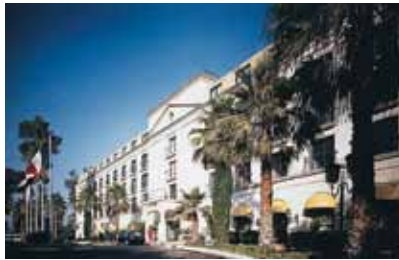
Conrad El Salam Hotel