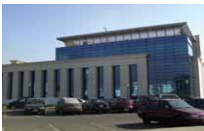
TE-Data - Smart Village