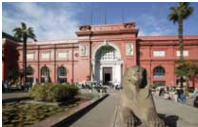
Egyptian Museum- Downtown