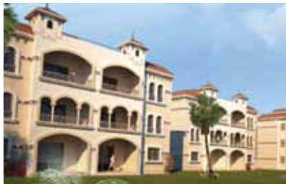
Palm Hills Residence