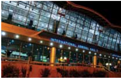
Cairo International Airport